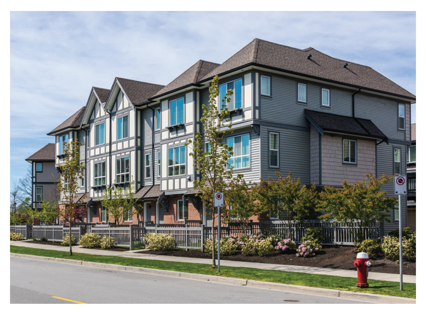
© 2014 Housing Equality Center of Pennsylvania. All Rights Reserved.