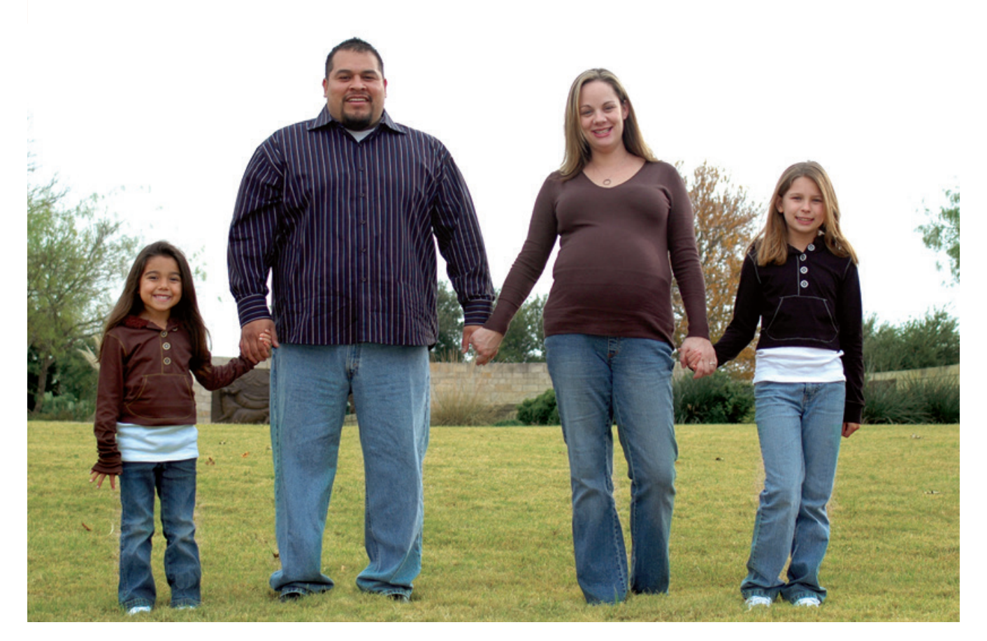
© 2014 Housing Equality Center of Pennsylvania. All Rights Reserved.

These types of decisions are the parent's choice to make, and cannot be dictated by a housing provider. Occupancy policies that are more restrictive than two people per bedroom may also be a violation of the Fair Housing Act. Generally, the U.S. Department of Housing and Urban Development states that an occupancy policy of two people per bedroom is generally reasonable. The reasonableness of any occupancy policy, however, may depend on factors such as the size of the bedrooms), the overall size and configuration of the dwelling, the capacity of septic, sewer or other building systems, or the existence of state or local zoning laws.